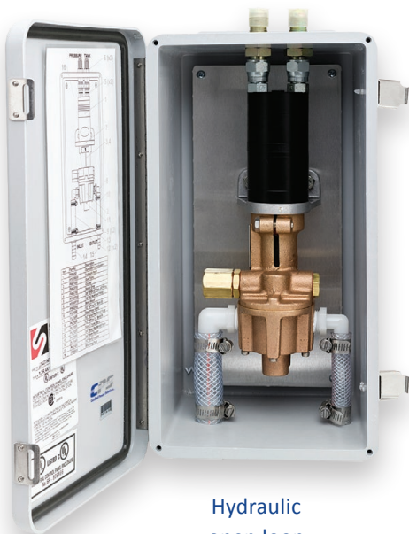
Hydraulic open loop