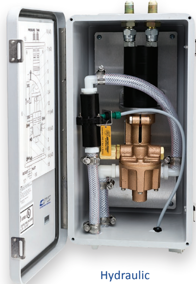
Hydraulic closed loop