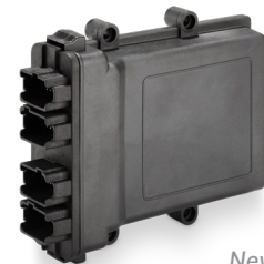
New Output Module